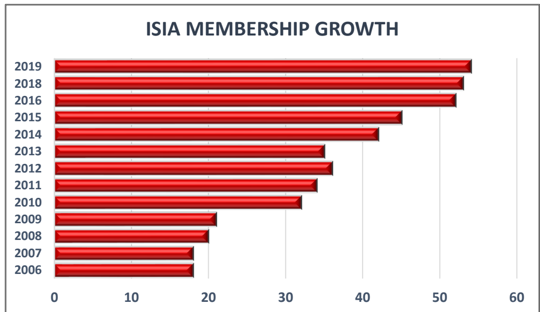
Figure 1: ISIA Membership Growth